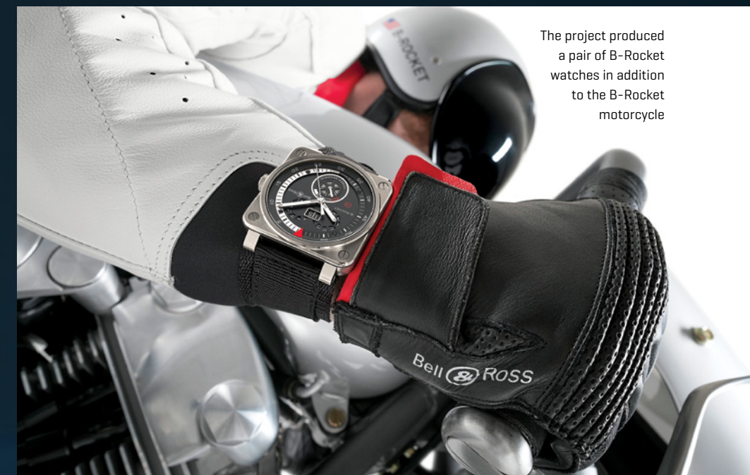
The project produced a pair of B-Rocket watches in addition to the B-Rocket motorcycle

For Shaw Speed & Custom, the goal was to build something unique, something stimulating to the eye, and something that would be appreciated by the motorcycle com-