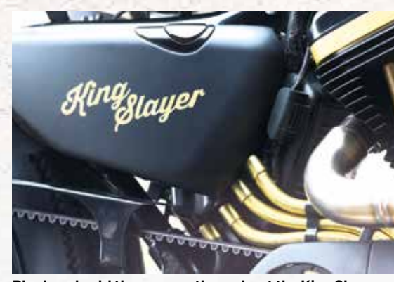
Black and gold theme runs throughout the King Slayer